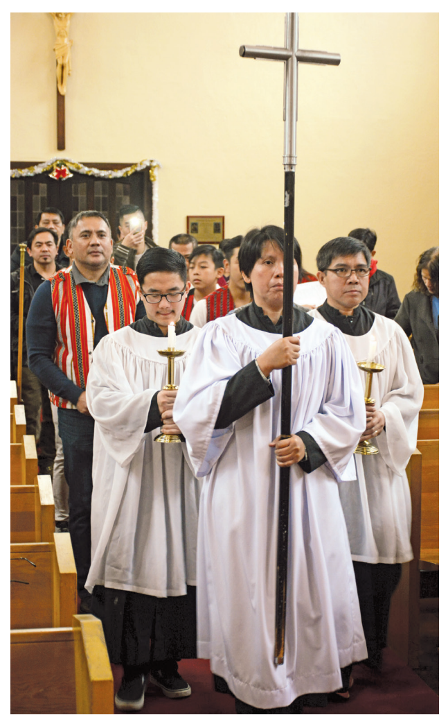
The Procession of the Gifts with Gangsa (ceremonial gongs).