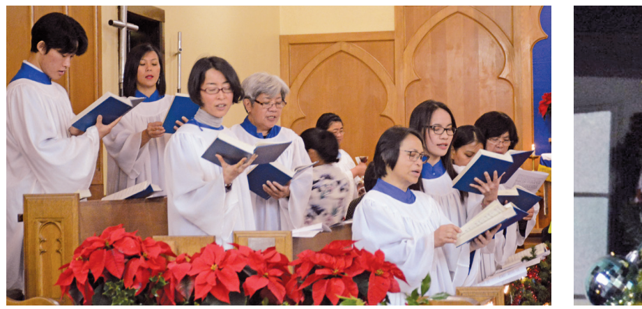
The choir leads the Offertory Hymn.