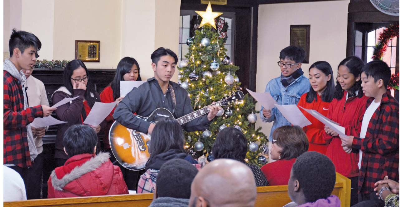
Youth of the parish lead the singing of a medley of Christmas songs.