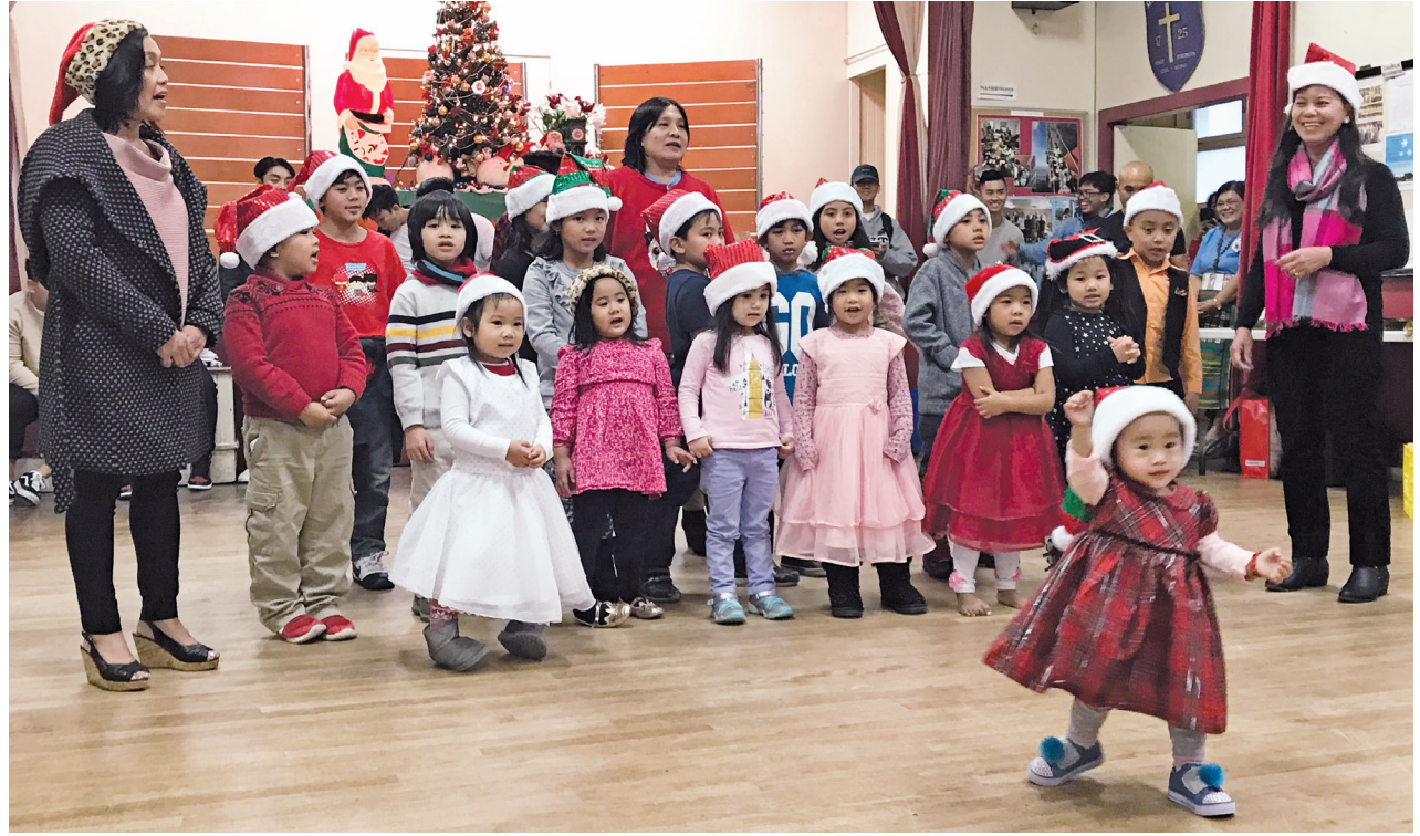
A song is offered by the youngest members of the parish.