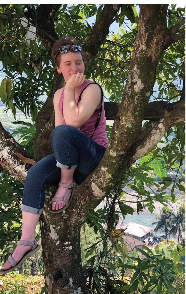
Jade in a tree.