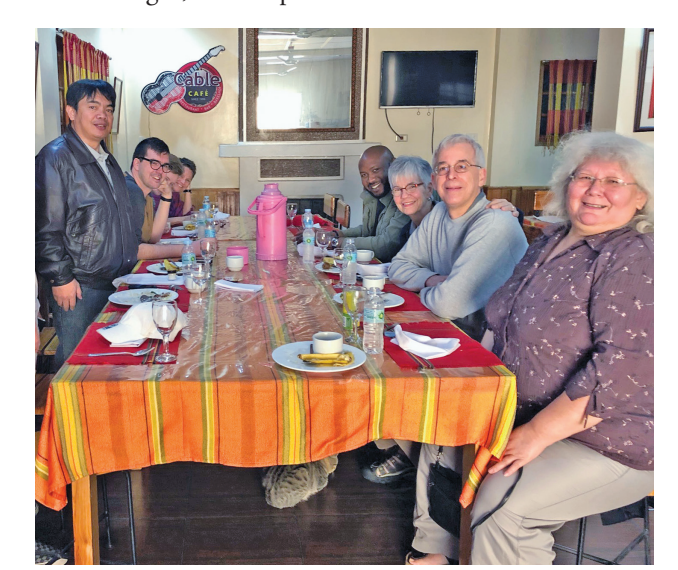
Diocese of New Westminster Ambassadors stop for a meal.

On February 17 after 13 ½ hours aboard a full Philippine Airlines flight, an intrepid team of travellers from the dio-