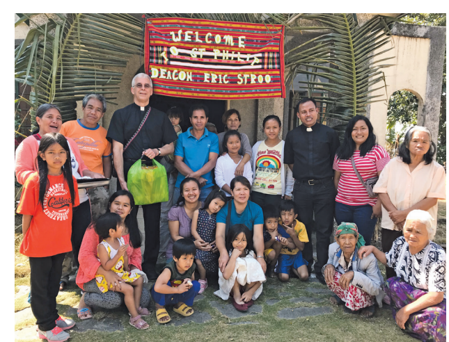
The folks at the "preaching station" of St. Philip which is an adjunct of St. Michael and All Angels, EDNP which is the partner parish of his parish, St. Michael's, Vancouver (Multicultural).

trip and many more photos will be available on the diocesan website and in a future issue of Topic . ♥