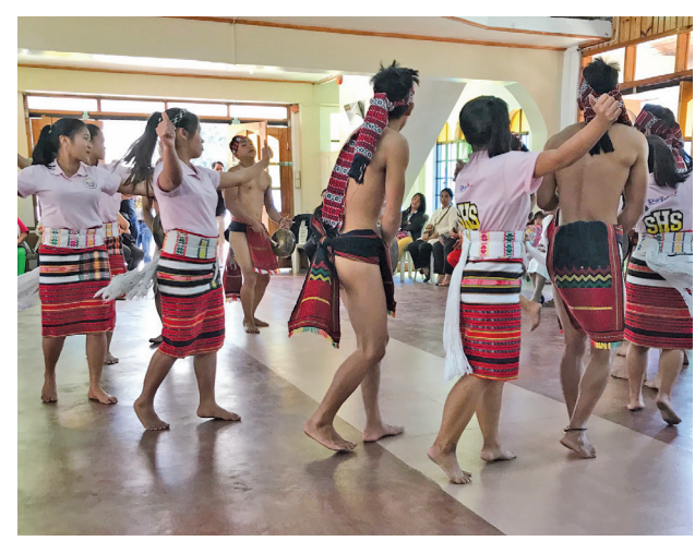
Traditional dancing in honour of the visitors to St. Paul's.

trip and many more photos will be available on the diocesan website and in a future issue of Topic . ♥