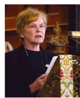
World Day of Prayer Observed at Holy Trinity, New Westminster