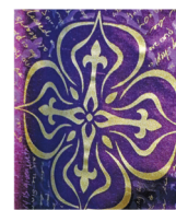
New Lenten Vestments Blessed at Christ Church Cathedral