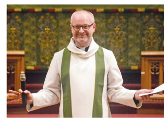
St. Paul's Welcomes New Rector