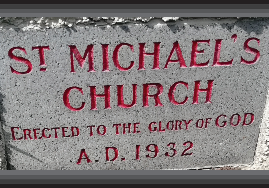
IMAGE #3 | In St. Michael Multicultural's 133rd year, the 1932 Cornerstone of the fourth church.