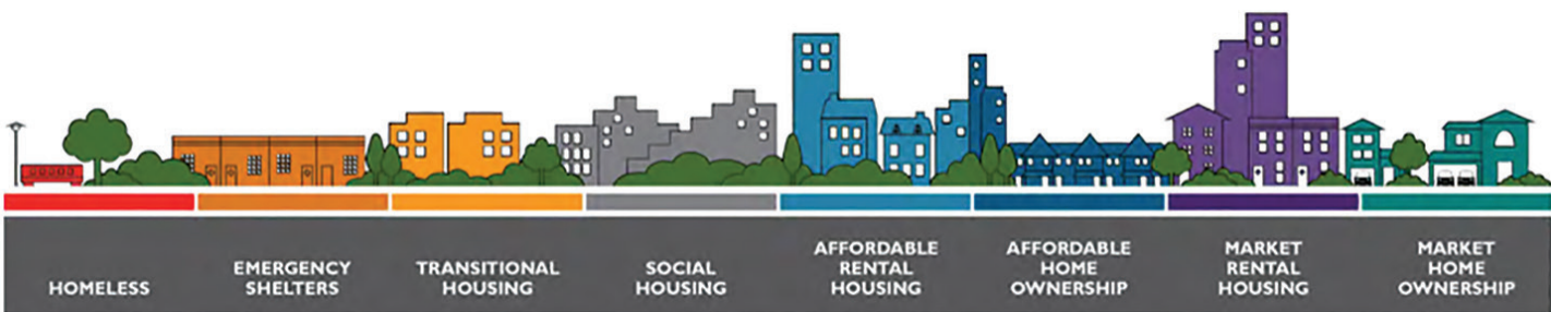
IMAGE #1 | The Housing Continuum

The catalyst for setting up the initial meeting with the Diocesan Redevelopment Committee was the announcement by the City of Vancouver of the proposal to build the Broadway Corridor Skytrain extension and have it in service by 2025. The map shows the Broadway Skytrain extension, while the bottom "X" shows SMM at the "bend" of the line, within four blocks of, not one, but two different Skytrain stations (see IMAGE #2).